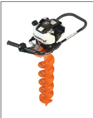
242H Hole Digger

Dimensions depicted are for reference only