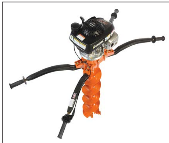
262H Hole Digger