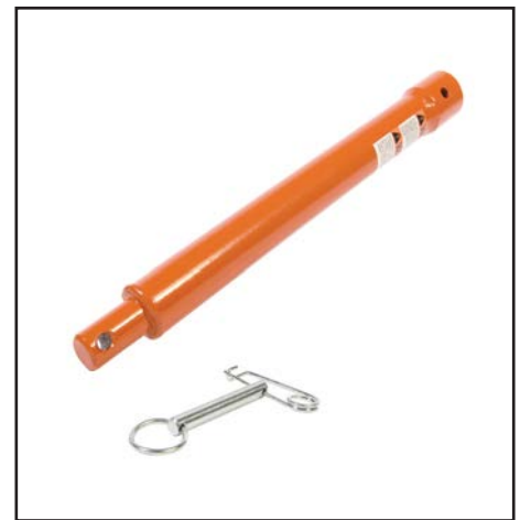
2350-15X Plain Shaft Auger Extension

All specifications are general in nature and are not intended for specific application purposes. General Equipment Company reserves the right to make changes in design, engineering, or specifications and to add improvements or discontinue manufacture at any time without notice or obligation. Consult applicable Operator Manual before utilizing. Names depicted are the registered trademarks of their respective owners. Form: GEF02012001 v1.0